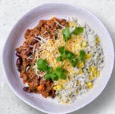
CHILLI CON CARNE WITH MEXICAN RICE