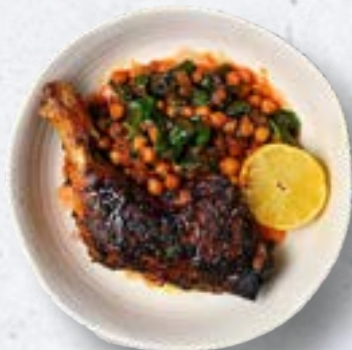
HARISSA ROASTED CHICKEN MARYLAND WITH CHICKPEAS & SPINACH