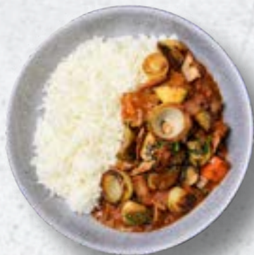
BEEF BOURGUIGNON WITH STEAMED RICE