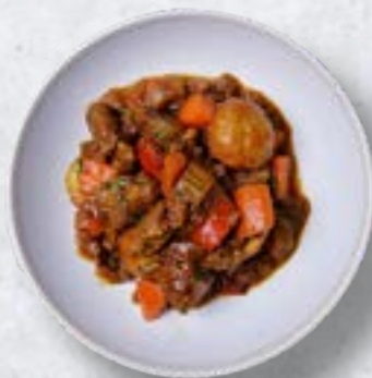
PEPPER BEEF STEW WITH ROAST CHAT POTATOES