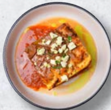
VEGETARIAN MOUSSAKA WITH NAPOLITANA SAUCE