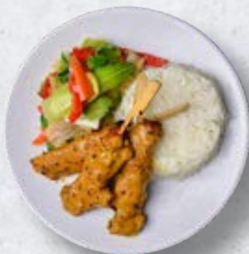
CHICKEN SATAY SKEWERS, ASIAN GREENS & STEAMED RICE