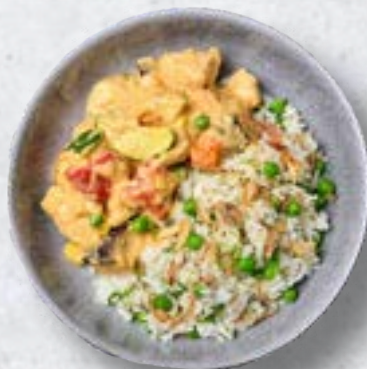
THAI RED CHICKEN CURRY WITH STEAMED RICE