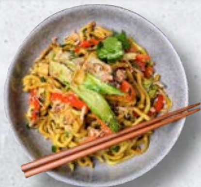
HOKKIEN NOODLE STIR FRY