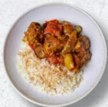
CHICKEN TIKKA MISALA WITH COCONUT RICE