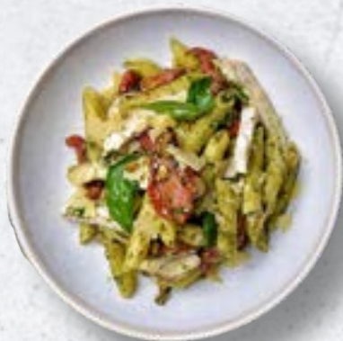
CHICKEN PENNE PESTO PASTA