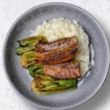
JAPANESE BBQ GLAZED PORK BELLY WITH STEAMED RICE & BOK CHOY