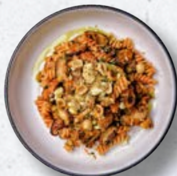
VEGAN MUSHROOM FUSILLI PASTA WITH PANGRATTATO