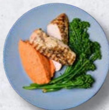
COUNTRY CHICKEN, BROCCOLI & SWEET POTATO MASH