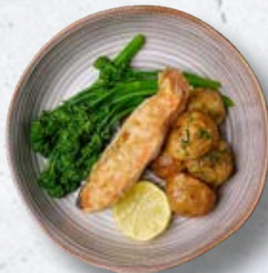
SALMON STEAK, ROAST CHAT POTATOES & BROCCOLI