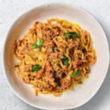
TRADITIONAL SPAGHETTI BOLOGNESE