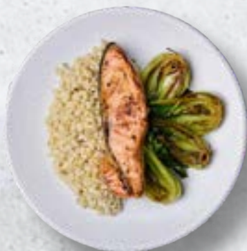
MISO GLAZED SALMON WITH BOK CHOY & BROWN RICE