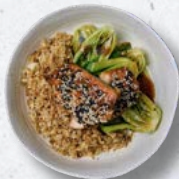
TERIYAKI CHICKEN, CAULIFLOWER RICE & BOK CHOY