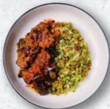
Sicilian Eggplant Stew with Almond Broccoli Rice Salad