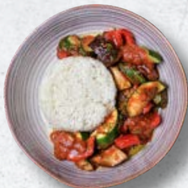
VEGETARIAN RATATOUILLE WITH STEAMED RICE