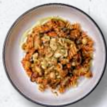
VEGAN MUSHROOM FUSILLI PASTA WITH PANGRATTATO