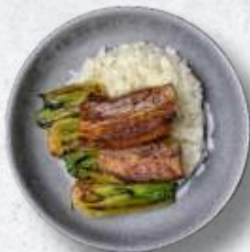
JAPANESE BBQ GLAZED PORK BELLY WITH STEAMED RICE & BOK CHOY