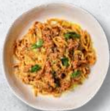
TRADITIONAL SPAGHETTI BOLOGNESE