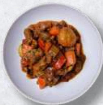
PEPPER BEEF STEW WITH ROAST CHAT POTATOES