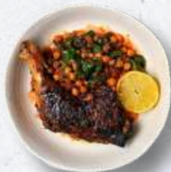
HARISSA ROASTED CHICKEN MARYLAND WITH CHICKPEAS & SPINACH