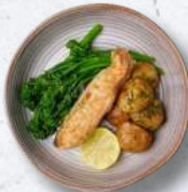
SALMON STEAK, ROAST CHAT POTATOES & BROCCOLI