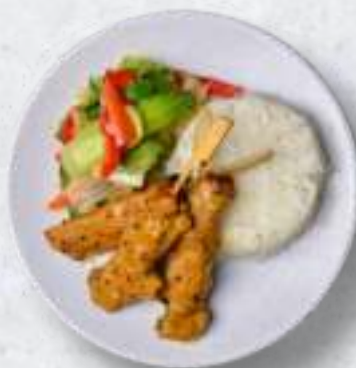
CHICKEN SATAY SKEWERS, ASIAN GREENS & STEAMED RICE