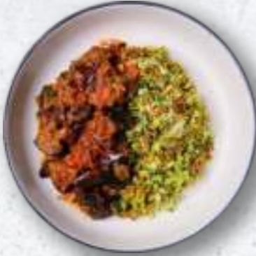
Sicilian Eggplant Stew with Almond Broccoli Rice Salad