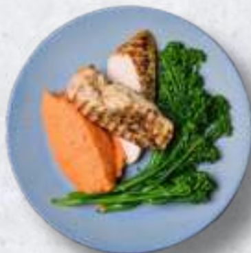
COUNTRY CHICKEN, BROCCOLI & SWEET POTATO MASH