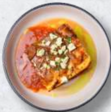
VEGETARIAN MOUSSAKA WITH NAPOLITANA SAUCE