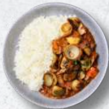
BEEF BOURGUIGNON WITH STEAMED RICE