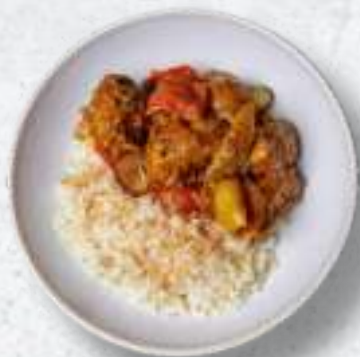
CHICKEN TIKKA MISALA WITH COCONUT RICE