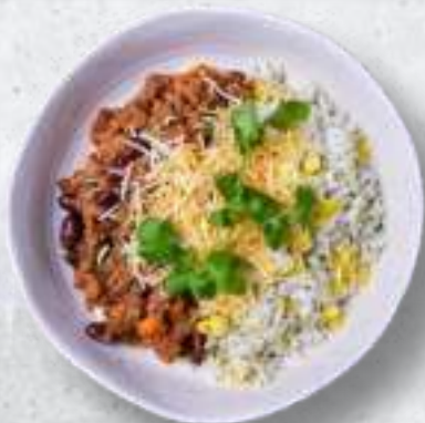
CHILLI CON CARNE WITH MEXICAN RICE