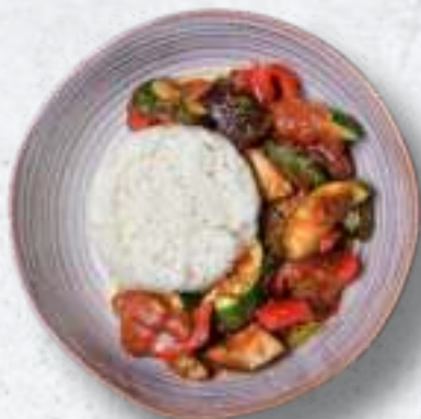
VEGETARIAN RATATOUILLE WITH STEAMED RICE