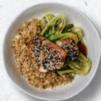
TERIYAKI CHICKEN, CAULIFLOWER RICE & BOK CHOY