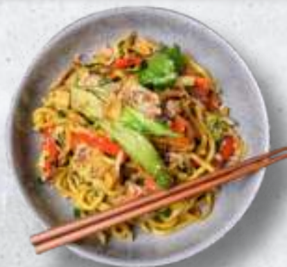
HOKKIEN NOODLE STIR FRY