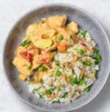
THAI RED CHICKEN CURRY WITH STEAMED RICE