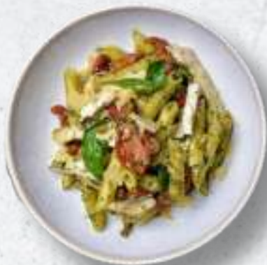
CHICKEN PENNE PESTO PASTA