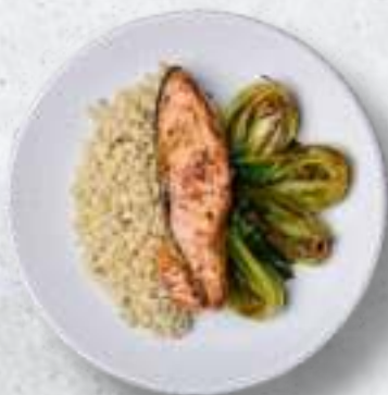
MISO GLAZED SALMON WITH BOK CHOY & BROWN RICE