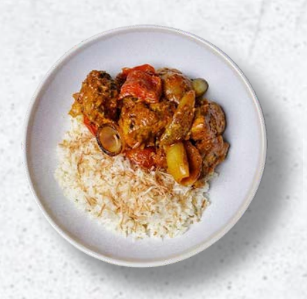
CHICKEN TIKKA MISALA WITH COCONUT RICE