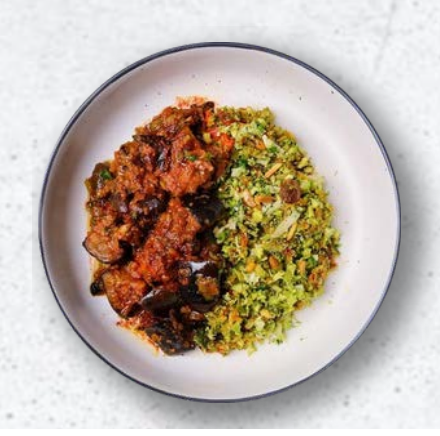
Sicilian Eggplant Stew with Almond Broccoli Rice Salad