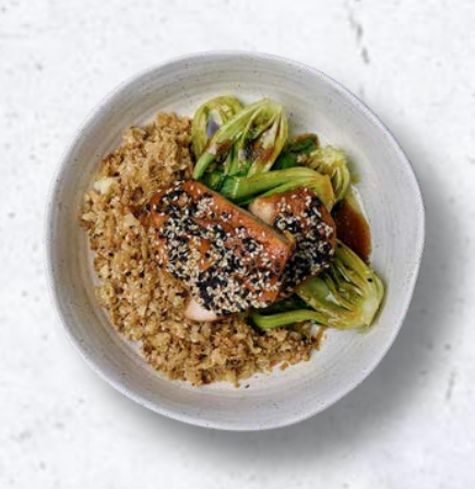
TERIYAKI CHICKEN, CAULIFLOWER RICE & BOK CHOY