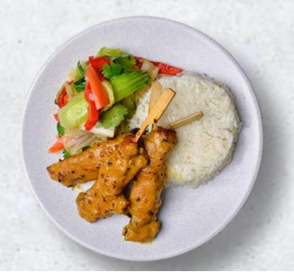
CHICKEN SATAY SKEWERS, ASIAN GREENS & STEAMED RICE