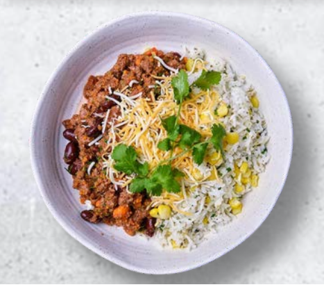
CHILLI CON CARNE WITH MEXICAN RICE