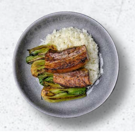
JAPANESE BBQ GLAZED PORK BELLY WITH STEAMED RICE & BOK CHOY