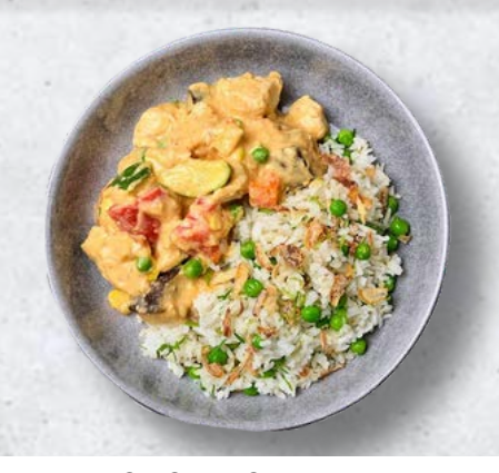
THAI RED CHICKEN CURRY WITH STEAMED RICE