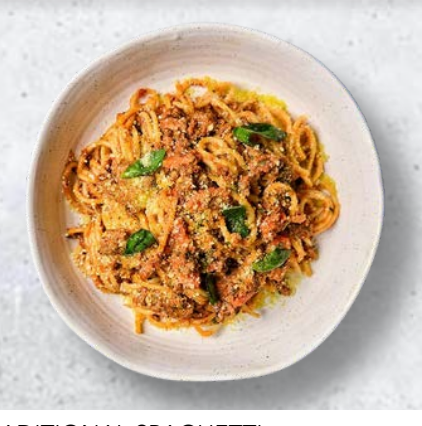
TRADITIONAL SPAGHETTI BOLOGNESE