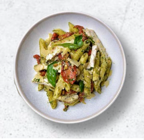
CHICKEN PENNE PESTO PASTA