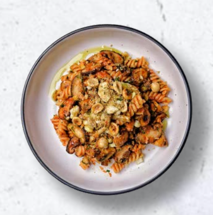
VEGAN MUSHROOM FUSILLI PASTA WITH PANGRATTATO