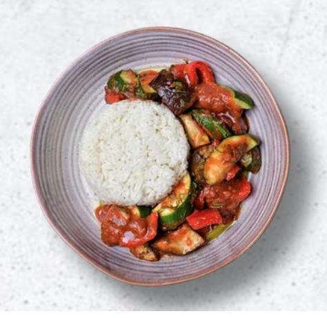
VEGETARIAN RATATOUILLE WITH STEAMED RICE