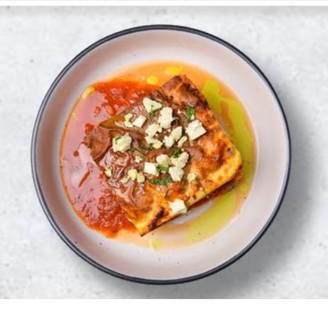
VEGETARIAN MOUSSAKA WITH NAPOLITANA SAUCE