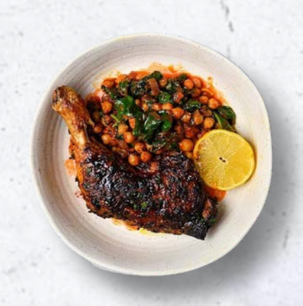
HARISSA ROASTED CHICKEN MARYLAND WITH CHICKPEAS & SPINACH