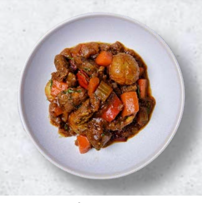
PEPPER BEEF STEW WITH ROAST CHAT POTATOES