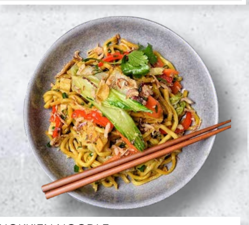
HOKKIEN NOODLE STIR FRY