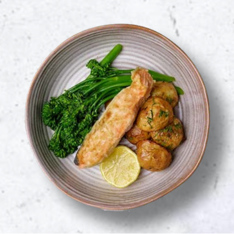
SALMON STEAK, ROAST CHAT POTATOES & BROCCOLI