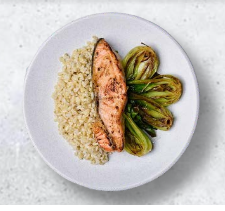
MISO GLAZED SALMON WITH BOK CHOY & BROWN RICE