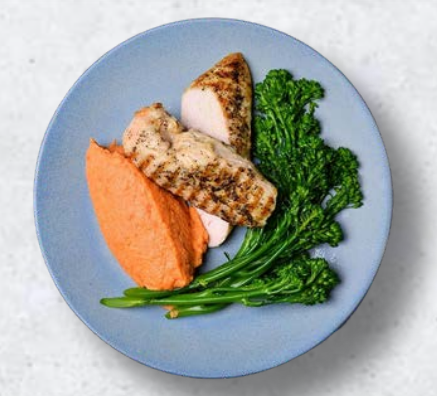
COUNTRY CHICKEN, BROCCOLI & SWEET POTATO MASH