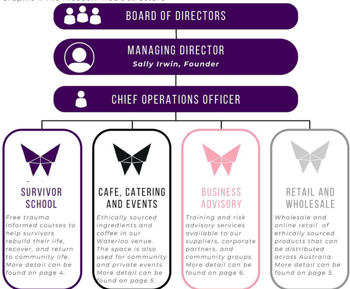
Graphic 1: The Freedom Hub's structure

The Freedom Hub currently employs around 3 full-time staff, 4 part-time staff, and 3 casuals to facilitate operations and has a network of over 30 volunteers across Australia who support our charity fundraising, community engagement, and administration. Despite unique functions, all operating units are considered to be the same reporting entity.